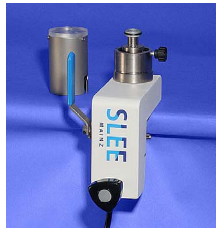
CO 2 bench freezer as option