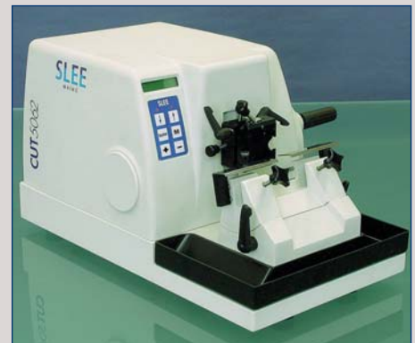
CUT 5062 – semi automatic rotary microtome

(specifications are subject to change without notice)